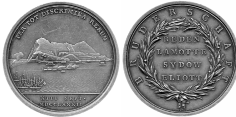
2 Defence of Gibraltar, 1779-83, General Elliot's Medal , in silver, as awarded to Hanoverian troops, 49 mm., a few scuffs, better than very fine £400-600